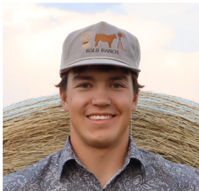
Reinhard Bold Trades Scholarship