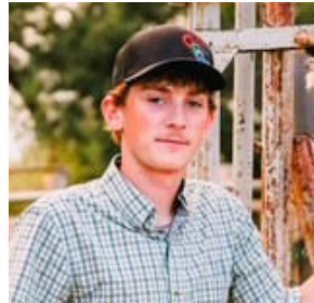
Kohen Sullivan Lineman Scholarship