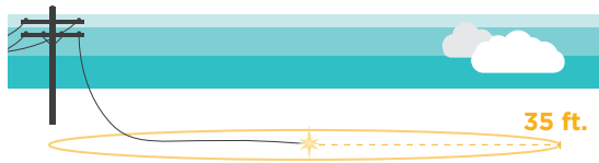
Downed power lines can energize the ground up to 35 ft. away - so keep your distance.

If you see a downed power line, always assume it is energized and dangerous. Avoid going near it or anything in contact with the power line.