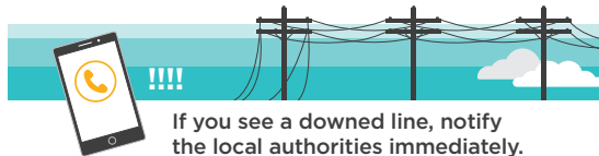
If you see a downed line, notify the local authorities immediately.